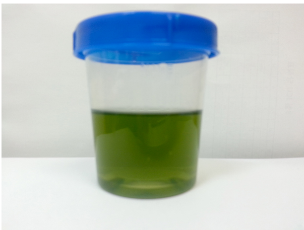
Fig. 2. Green-colored urine in case 2; 48 hours after propofol infusion.

A 28-year-old woman was admitted into the ICU in an intubated status. She was transferred after having gotten mandible osteotomy and genioplasty from the local plastic surgery clinic with massive bleeding intraoperative period. Even though her mental status was alert, considering the hypovolemic status and unsecured airway due to facial and neck swelling, we decided to postpone extubation and sedated her with propofol and remifentanyl. After 48 hours of propofol infusion, the urine color changed to green (Fig. 2). Urinalysis showed a pH of 6.0, specific gravity of